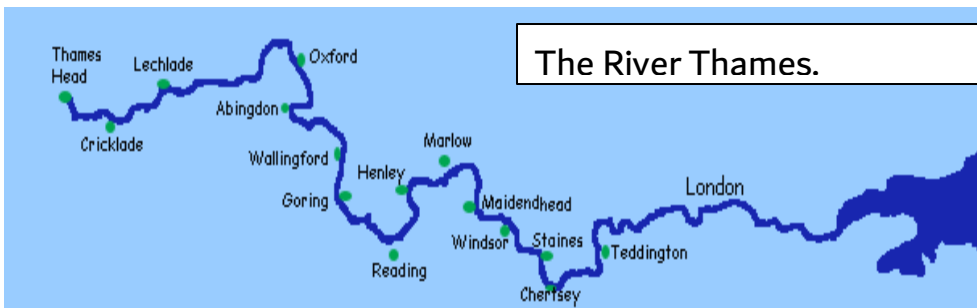
The River Thames.

There is a 7 metre difference between low and high tides at London Bridge.