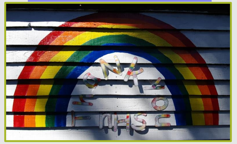
Check out this incredible rainbow painted by children at school!