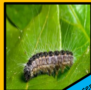
An amazing observation and write-up Sebastien. Well done!