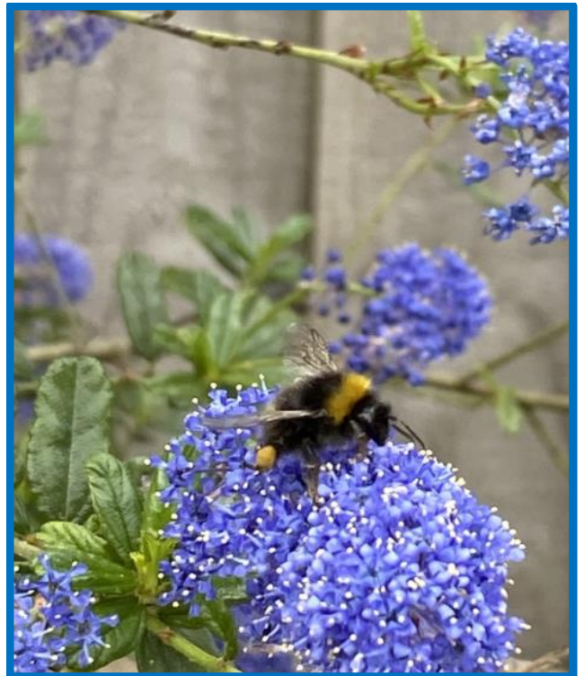
Wildlife photography by Charlie