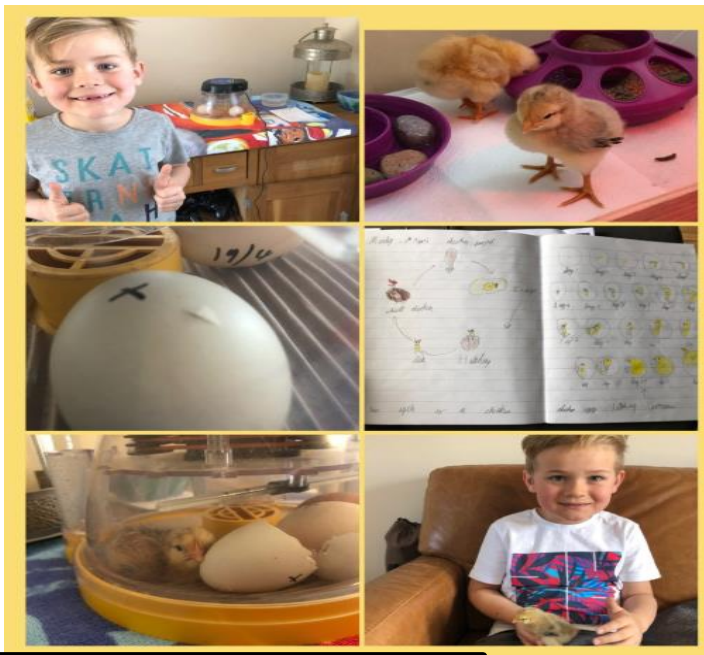
These chicks are very cute! Well done Zac!