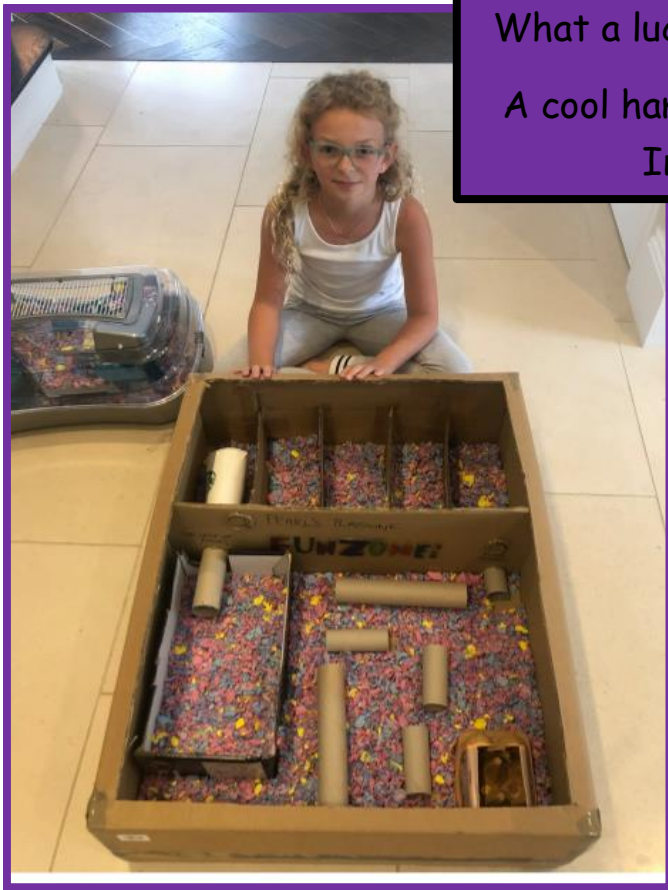
What a lucky hamster! A cool hamster run by India